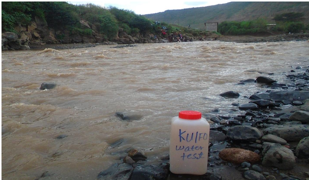
Figure 2. The upper catchment of where water samples was taken